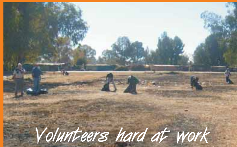
Volunteers hard at work

Tsatsi la ho hwekisa ke karolo ya malkemisetso a Masepala wa Midvaal ya ho ruta baahi ho se lahlele matlakala hohle, ho se lahlele matlakala dibakeng tse sa hlwauwang e le ho phahamisa tihokomediso ya tihokomelo ya motswako wa diphoofolo le dimela hammoho le tikoloho.