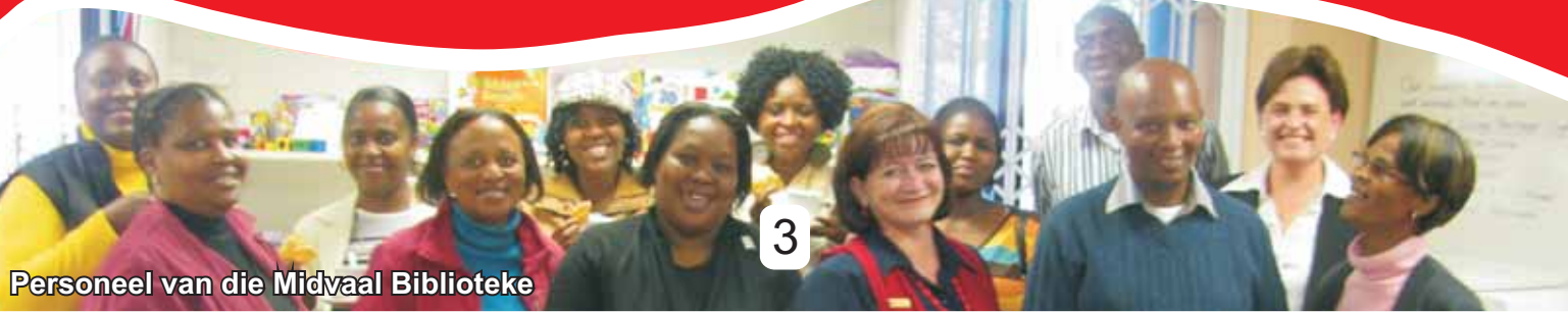
Personeel van die Midvaal Biblioteke